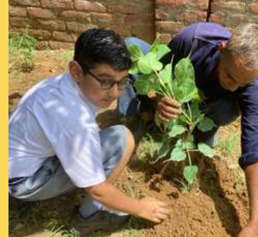
Plantation drive by Pre Primary & Primary classes