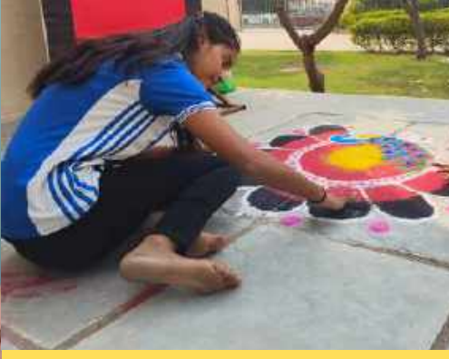
CREATIVE ARTS- WORLI ART, JUTE ART. YARN ART AND ANIME CHARACTER DRAWING AS HEROES OF TOMORROW EXHIBITED THE INCREDIBLE CREATIVITY OF THE STUDENTS.