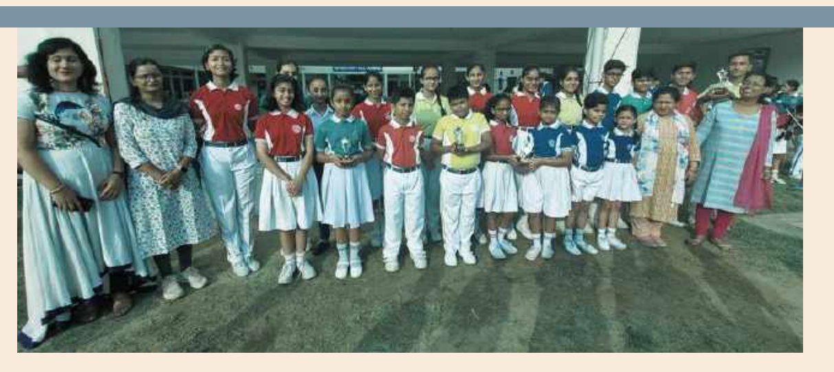
To ignite interest in STEAM Fields and spark curiosity among students by providing them with engaging and hands-on challenges that showcase the real-world applicatioons of these disciplines, our students won laurels iin an Inter-school STEAM EXPO held at Podar World School, Jaipur.

The winning and jubilant team earned medals and trophies at levels different in various categories, namely: Junior Level (Grade IV)-1ST Prize- Project-Hydraulic Bridge (Grade V)- 2nd Prize-Project-Automatic Dustbin Middle Level (Grade VI)-2nd Prize- Project-Smart Bridge Senior Level (Grade X)-1st Prize-Project-Follow Me Bot- A Robotic Project