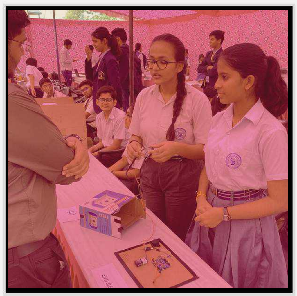
The outcome of this participation provided a platform for students to showcase their innovative ideas and creative projects, encouraging out-of-the-box thinking and originality in approaching STEAM-related challenges.

The winning and jubilant team earned medals and trophies at levels different in various categories, namely: Junior Level (Grade IV)-1ST Prize- Project-Hydraulic Bridge (Grade V)- 2nd Prize-Project-Automatic Dustbin Middle Level (Grade VI)-2nd Prize- Project-Smart Bridge Senior Level (Grade X)-1st Prize-Project-Follow Me Bot- A Robotic Project