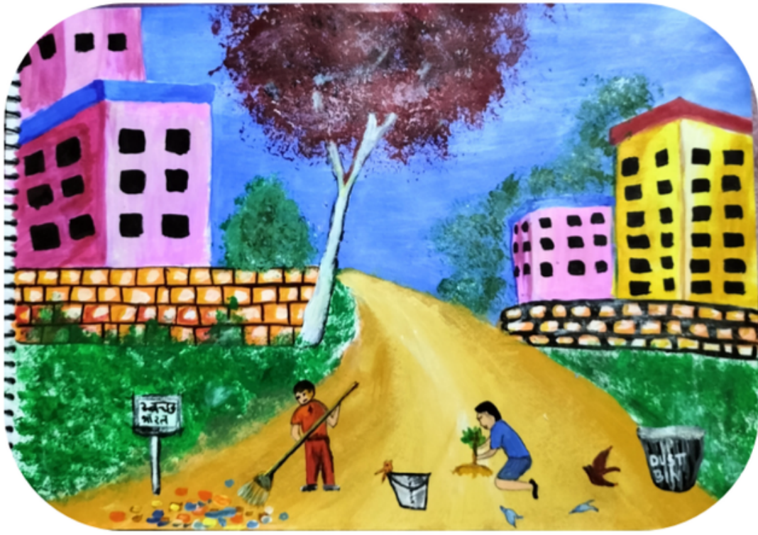
Suhani Saini VII-B