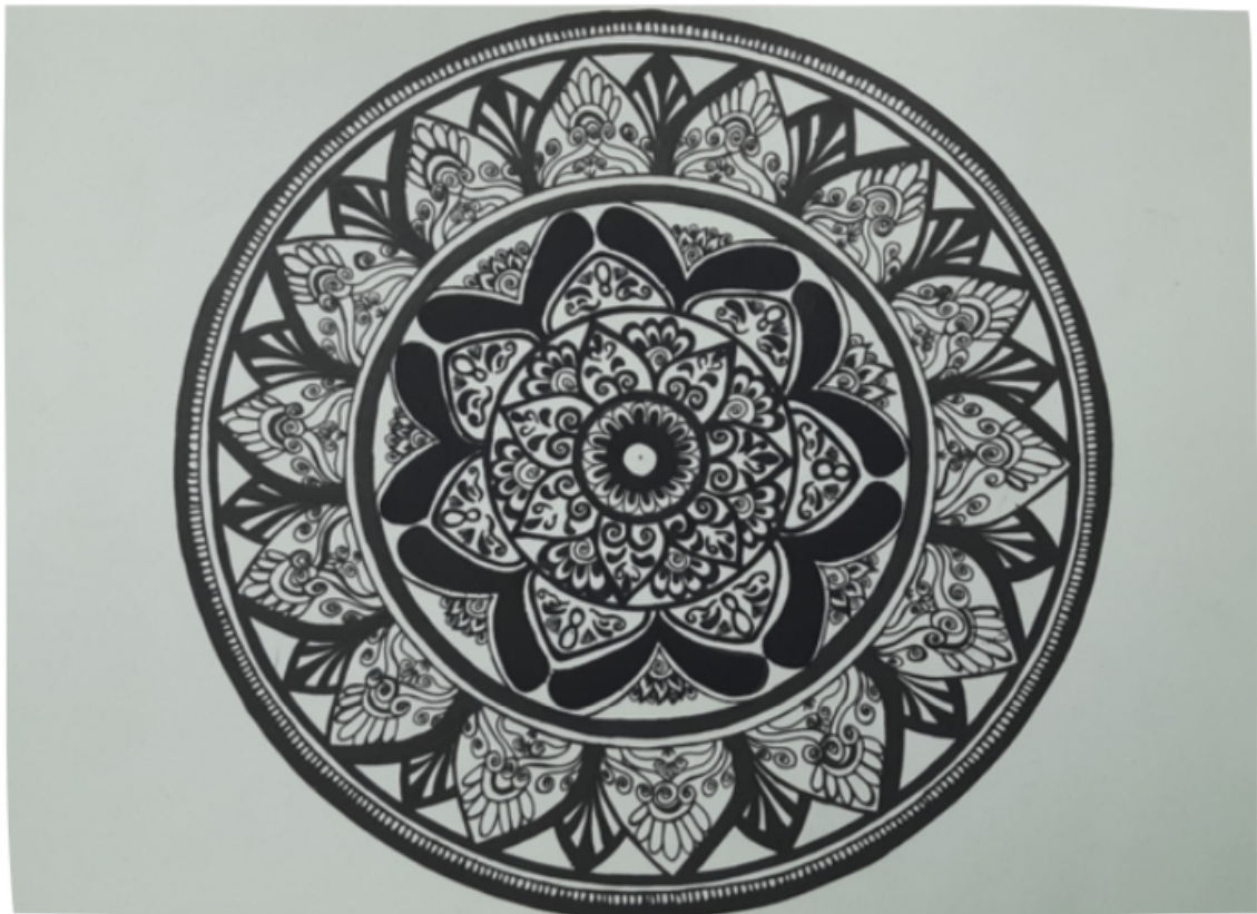
Bhumika Vohra XII-A