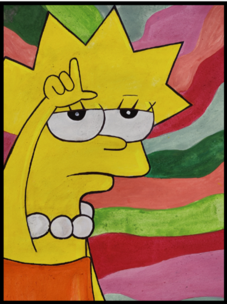
Ishita Baluni VIII-A