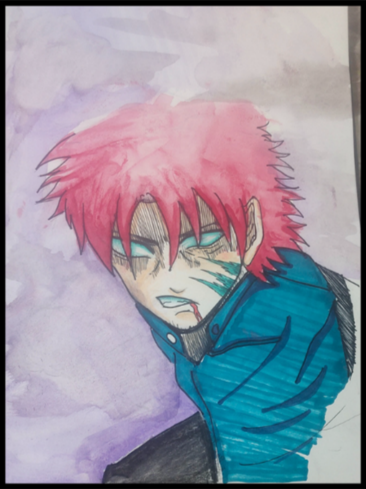
Prakul Basista VII B