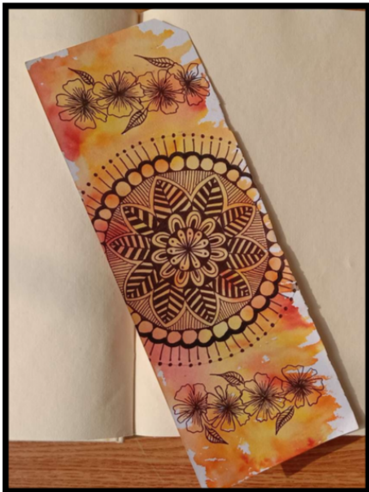
Privanka Lakra X-A