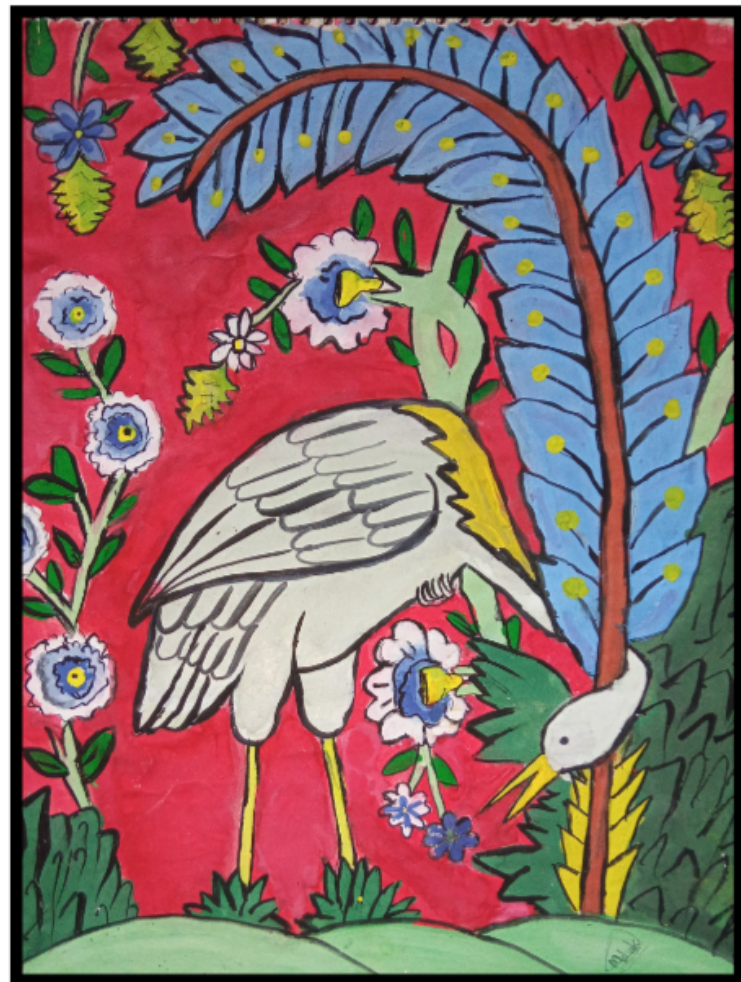
Mahak Bisht VIII-B