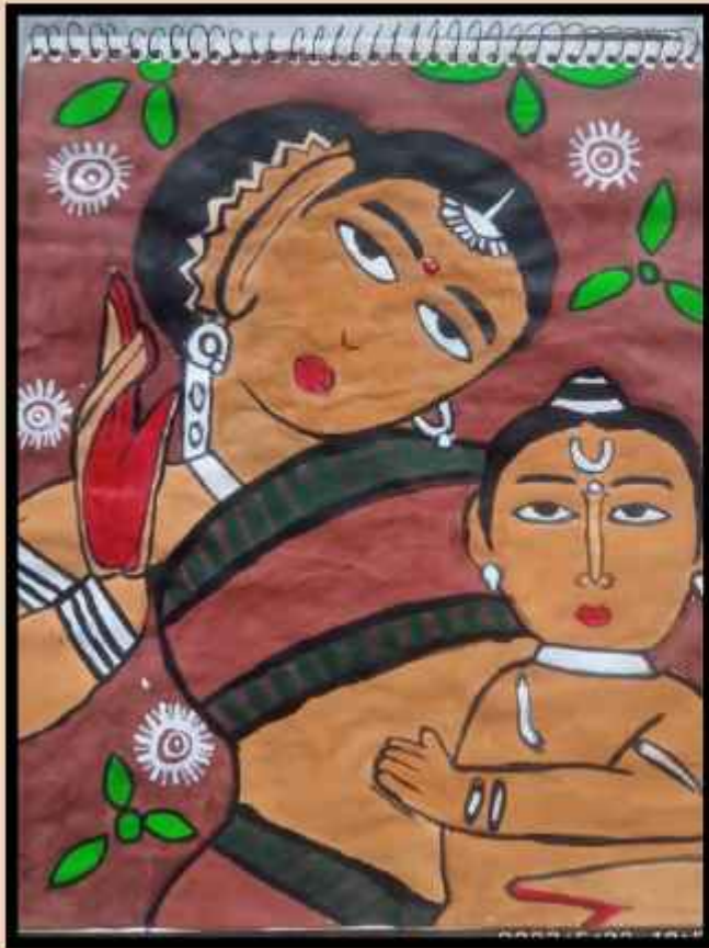
Mahak Bisht, VIII-B